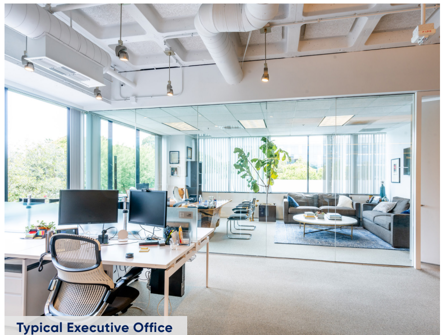
Typical Executive Office