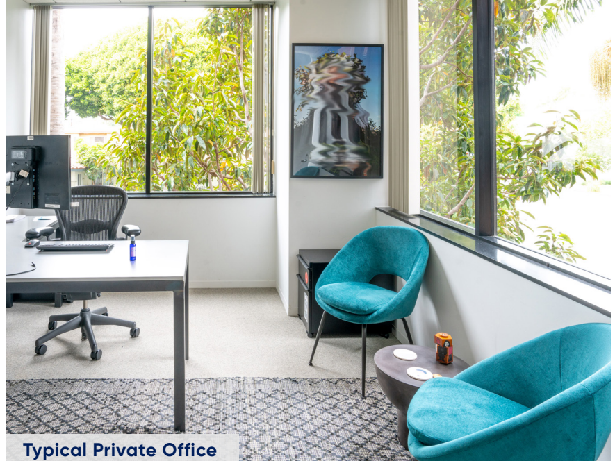
Typical Private Office