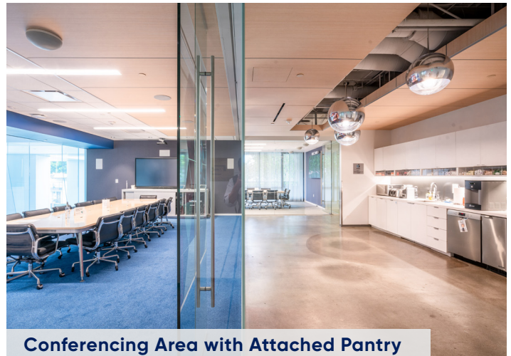
Conferring Area with Attached Pantry